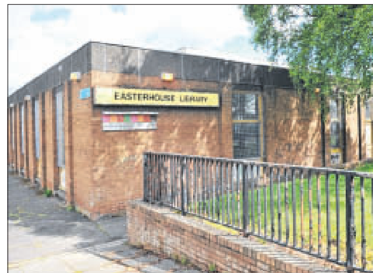
■ Easterhouse Library has been part of the area's transformation

Now, new housing and investment has rendered Easterhouse unrecognisable. And superb community work has made life better for the most vulnerable people living in the area.